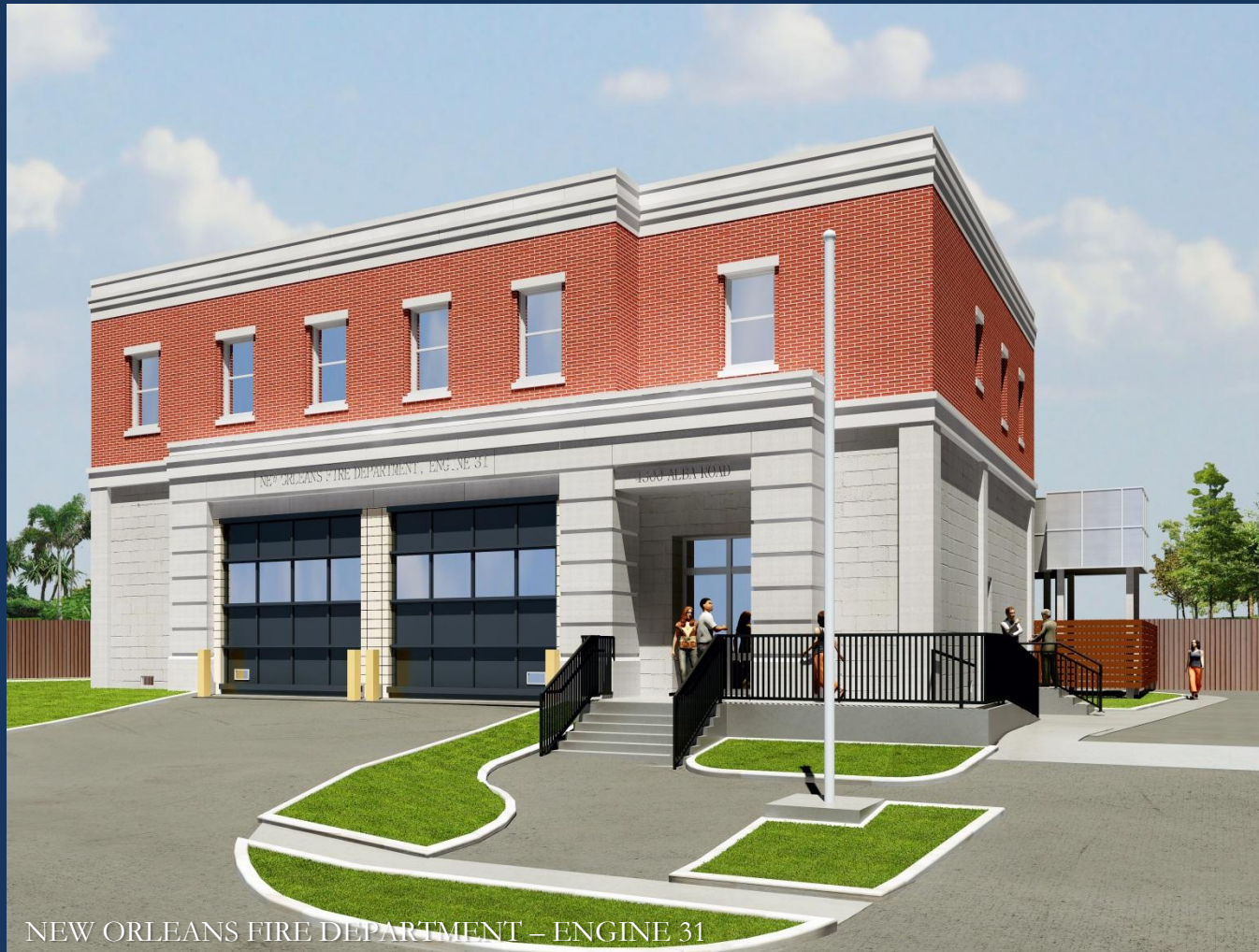
NEW ORLEANS FIRE DEPARTMENT – ENGINE 31