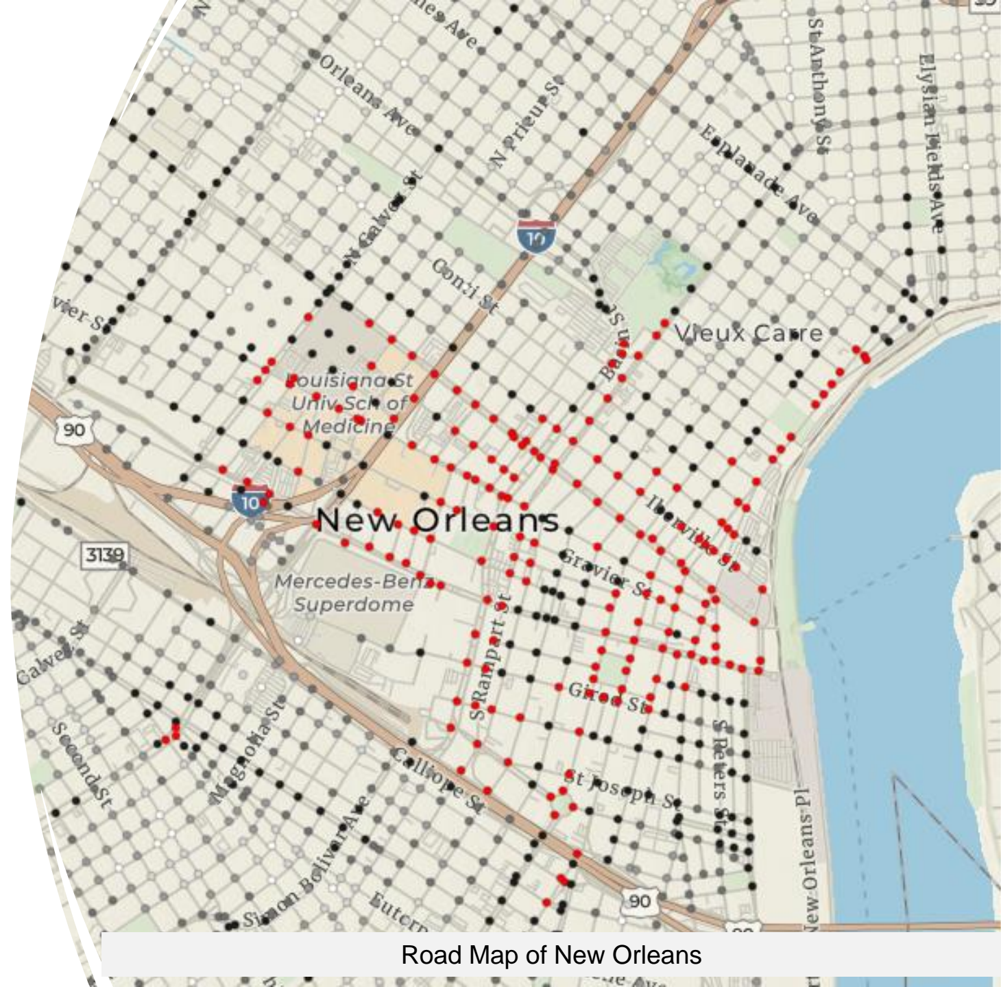
Road Map of New Orleans