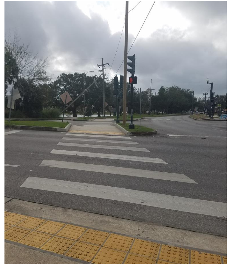
Wisner Path at Esplanade Avenue