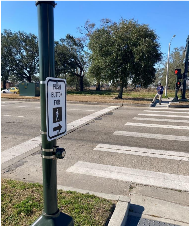
Accessible pedestrian signal on Bullard Avenue