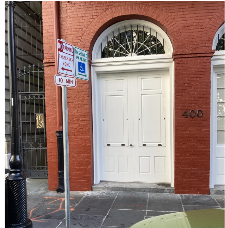
Designated accessible parking in the French Quarter