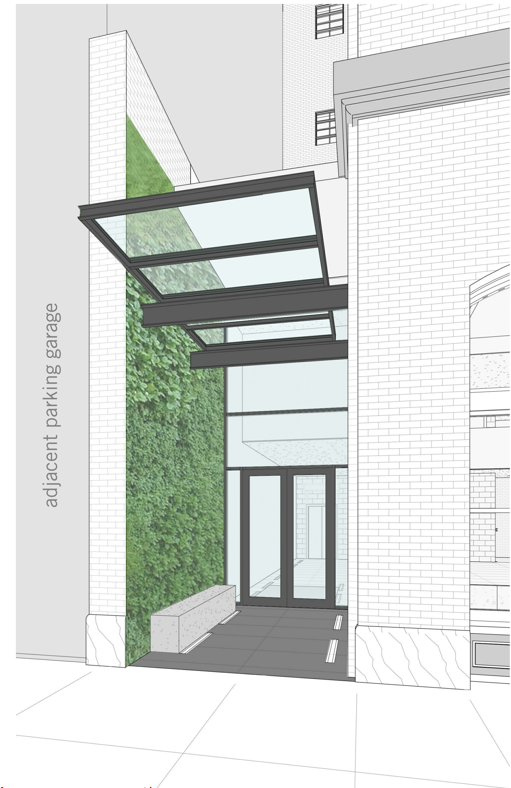
4 canopy perspective A6.31 scale: 1/2" = 1'-0"