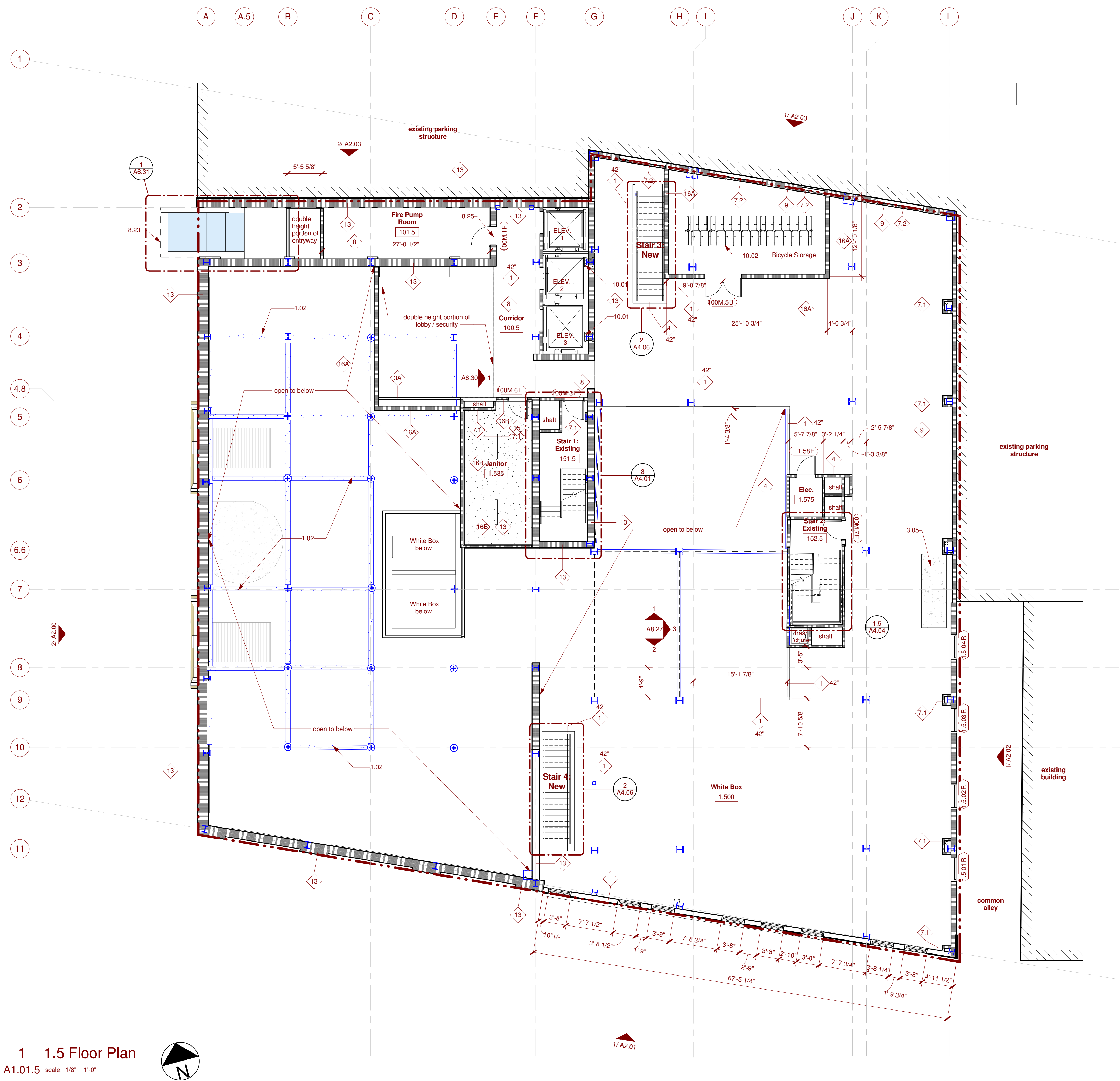
1 1.5 Floor Plan A1.01.5 scale: 1/8" = 1'-0"