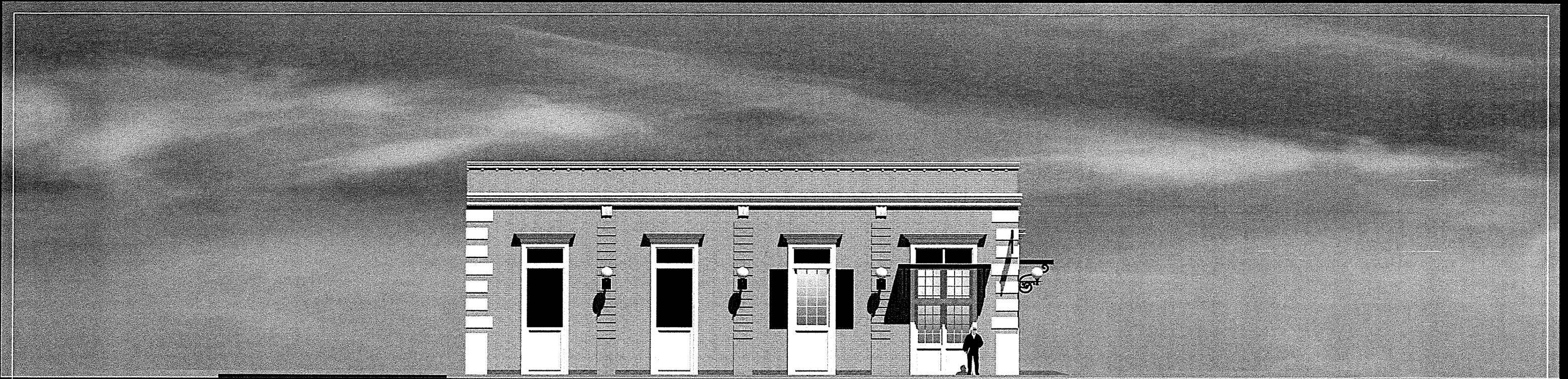
MAGAZINE ST. ELEVATION