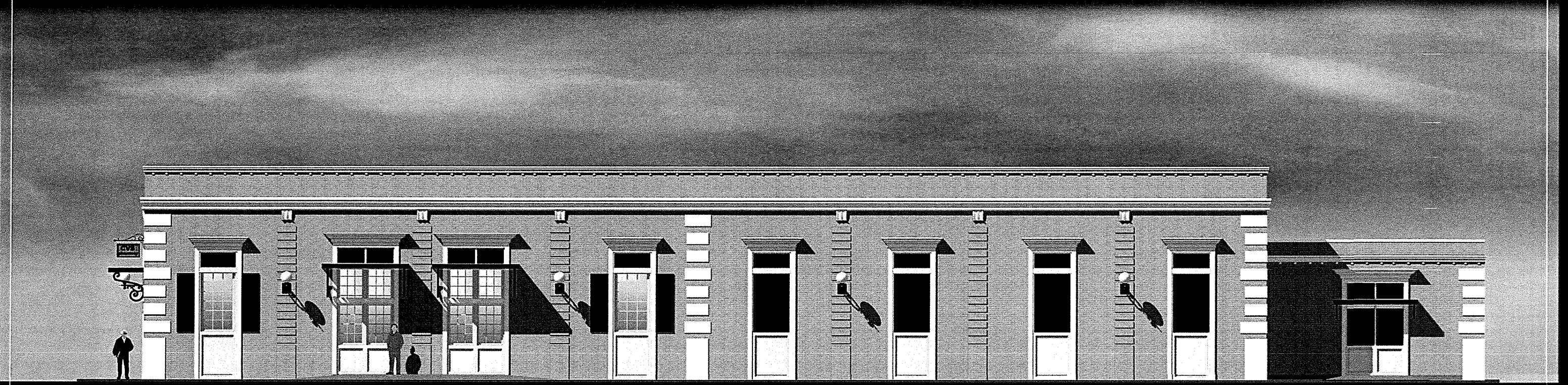
LOUISIANA AVE. ELEVATION