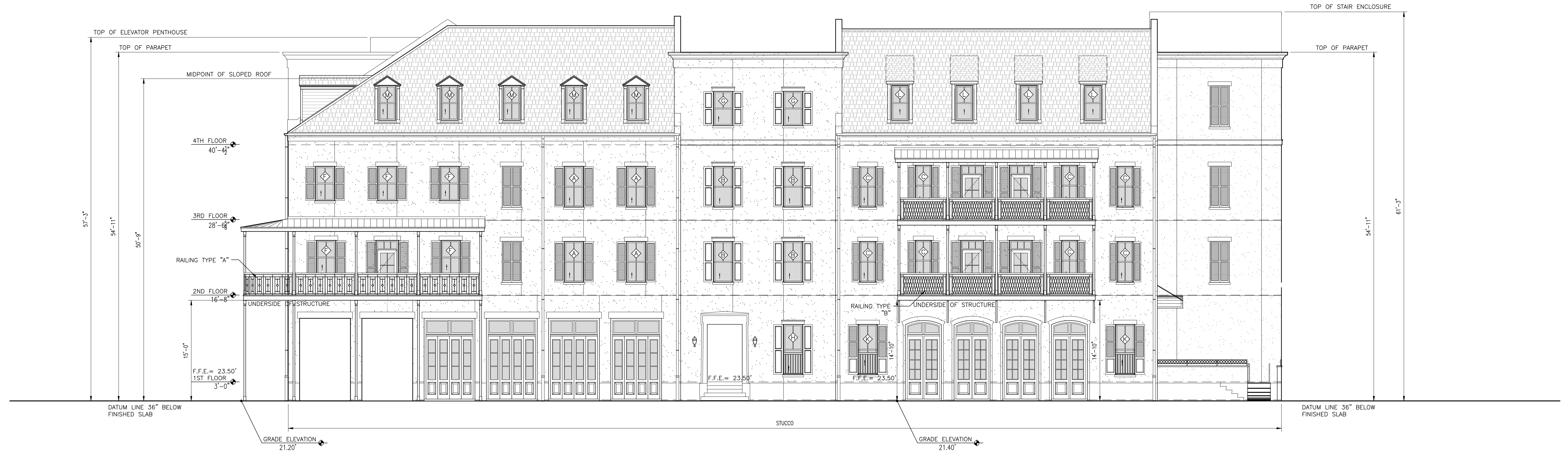
A1 BASIN STREET ELEVATION A202 SCALE: 1/8" = 1'-0"