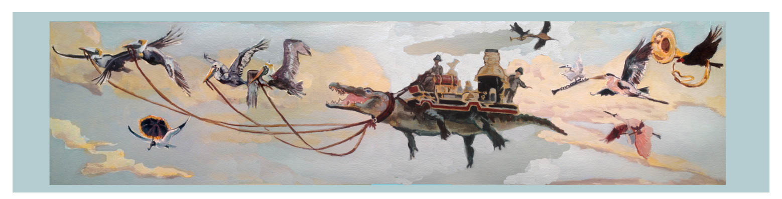
Chris Pavlik, sketch of mural at NOFD Fire Station 4, 1441 St. Peters St., New Orleans, LA

(Revision: the egret was replaced with an old style firetruck, creating a stronger reference to the New Orleans Fire Department).