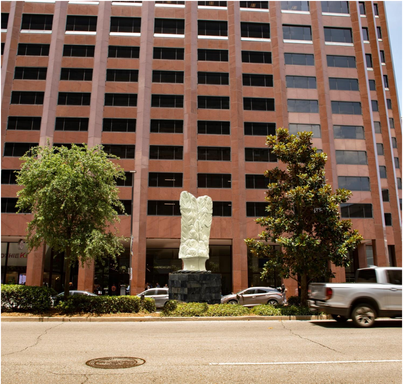
Photoshop of Tall Feather installed on Poydras