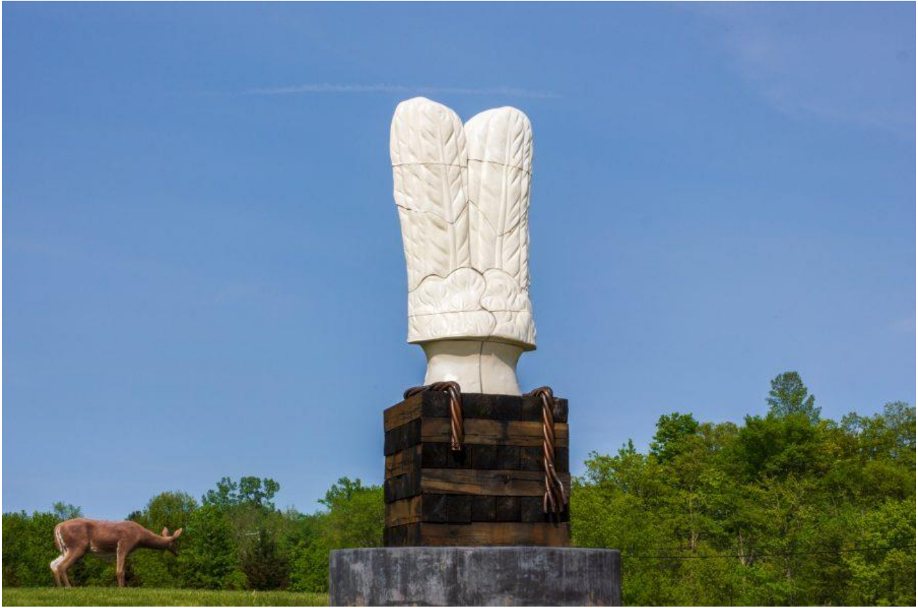
Arlene Shechet's Tall Feather installed at Art OMI