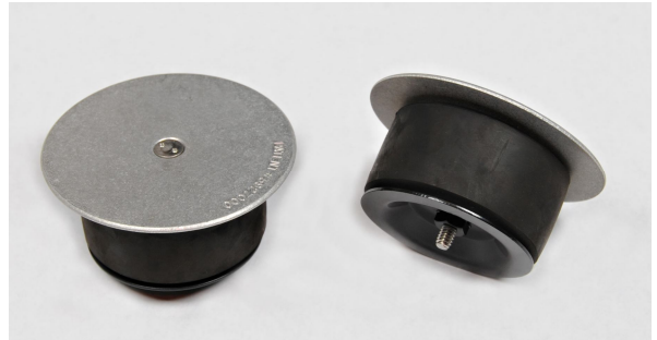
Water-resistant port covers developed by the City of New Orleans Mosquito & Termite Control Board