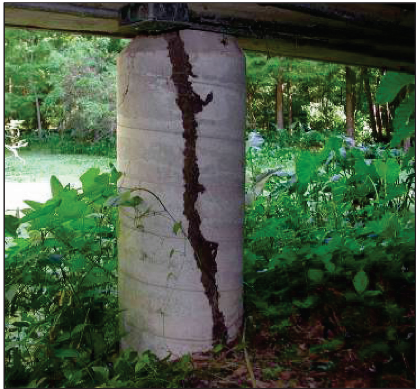
Figure 3. Subterranean termite shelter tube running from the ground to the structure along a support pier. (above)

Termites require moisture, food (wood), and shelter to survive and thrive. Eliminating sources of each from areas immediately surrounding your structure will reduce the likelihood of termite damage to your property. For example, mulch which rests against the foundation of a structure and that is watered regularly provides all three environmental requirements and invites termite problems.