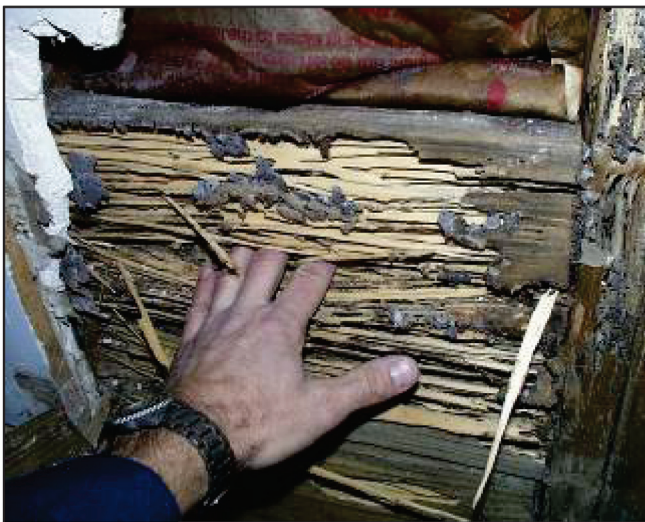
Figure 4. Formosan subterranean termite damage to structural timber. A sharp instrument such as an ice pick or screwdriver can be used to test the structural integrity of window sills, baseboards, and other wooden members. (left)