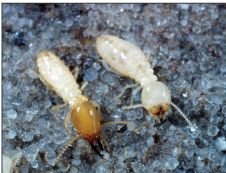
Figure 1. The most common castes in a termite colony are the soldier (left) and worker (right). Soldiers primarily function to defend the colony from invaders while workers actively forage for food.

T ermites play an important role as nature's recyclers of woody materials (i.e. stumps, roots, thatch). Conflict arises when termites locate and feed on wooden materials of economic importance such as homes, schools, and fences. Tens of millions of dollars are spent annually by homeowners and business owners in the City of New Orleans for the prevention and control of subterranean termites and the repair of damage they cause. It is important for residents to be able to readily distinguish termites from other common insects, to recognize signs of a termite infestation and/or damage, and to identify and remedy specific conditions that may increase the likelihood of termite infestations.