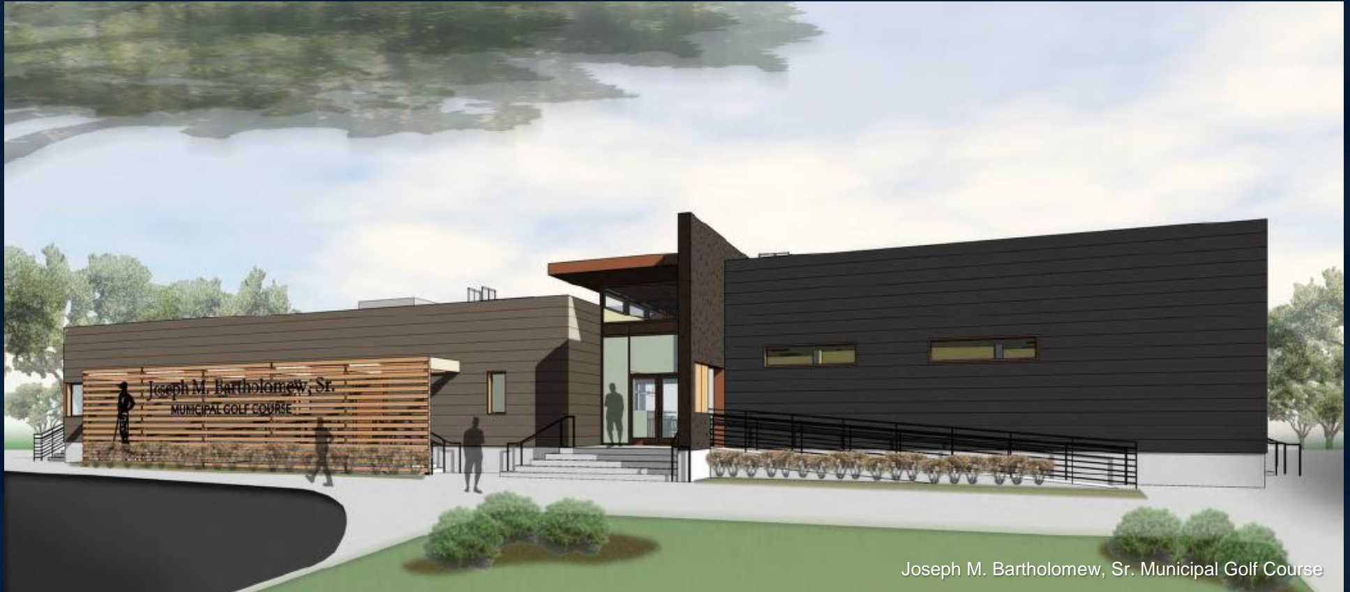
Joseph M. Bartholomew, Sr. Municipal Golf Course