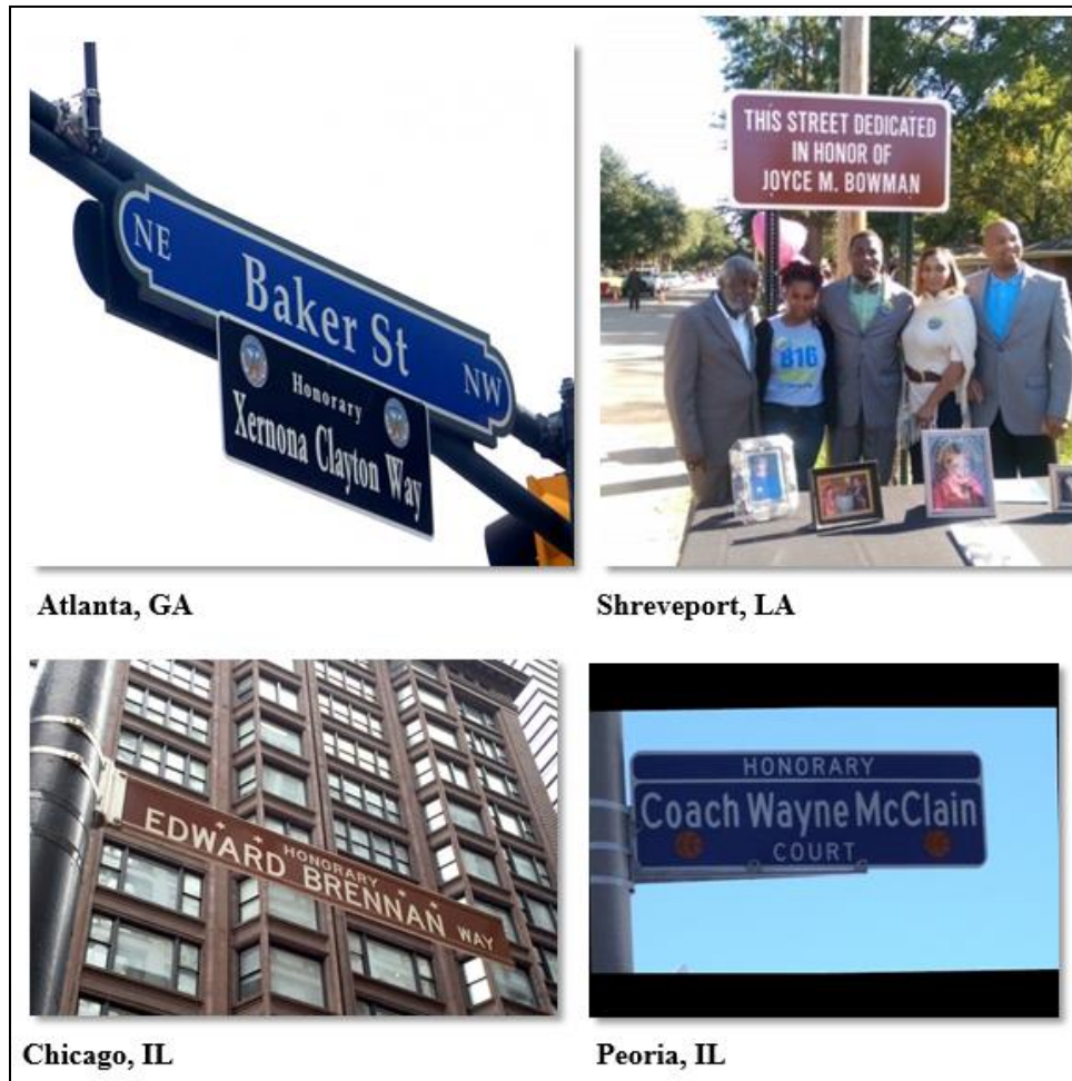
Figure 2. Honorary street signage within other communities.

Most honorary street name signs in other cities are mounted above or below the primary street name sign, or are otherwise clearly distinguishable from the official street name sign. A dedication sign may also be free standing and installed at a corner or mid-point along a particular street segment. Honorary, or ceremonial, signs usually have a distinct design and a contrasting color to distinguish them from the primary street name. Some street dedication signs may also specify the word “Honorary” or use the suffix “Way” to differentiate the dedication name from the formal street name.