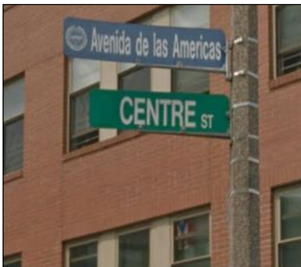
Figure 5. Honorary street sign in Boston’s Jamaica Plain neighborhood.

The City of Boston has implemented very few honorary street designations in recent years. In 2007, the Boston City Council approved to give Centre Street in the Jamaica Plain neighborhood the ceremonial name of “Avenida de las Americas” in honor of the community’s Latin heritage. The honorary name is displayed on a separate sign above the official street name sign. See Figure 5. The Council has since moved away from a ceremonial street naming program because of noted confusion experienced by the local Fire Department. 21 They have, however, developed a square dedication program to honor local veterans and significant local leaders, which the City has dubbed as the “Hero Square” program. With this