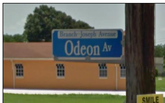
Figure 1. Example of honorary street sign in Algiers neighborhood, installed in 2009.

Honorary, also known as ceremonial, street dedication signage typically consists of a secondary sign that may be installed above or below an existing street name sign. An honorary street dedication does not replace the official street name or cause the need for the re-addressing the street. Honorary dedications may encompass all or a portion of an existing street. An honorary street dedication may also be installed for a predetermined period of time and later removed.