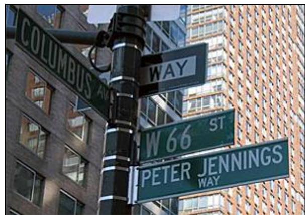
Figure 3. Example of honorary street sign in NYC.

According to the New York City Administrative Code, no streets which are currently laid out upon the city map are to be formally renamed. 10 However, the City has adopted a policy in which existing streets may be “co-named,” which in other words allows them to acquire an additional honorary name. Street co-naming requests must be approved by the New York City Council. The City Council generally approves of honorary street names in batches, two to four times a year. 11 In June 2011, for instance, 56 thoroughfares and