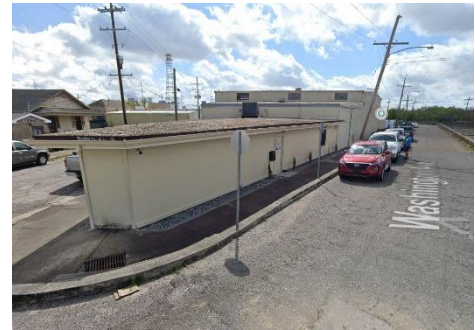
Figures 1. & 2. Subject Site

Surrounding Land Use Trends: The proposed site is directly adjacent to an open-air canal that is used to push water from the neighborhood to Lake Pontchartrain via the Melpomene Pumping station located four blocks south on South Broad Street. The eastern part of the proposed site is part of a small area that is approximately four blocks by three blocks which is all zoned HU-R2 Historic Urban Two-Family Residential.