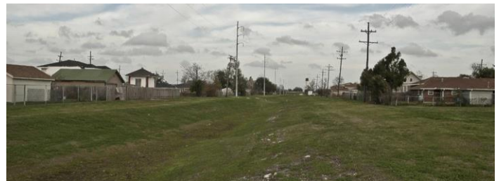
Dwyer Canal today.

Pontilly is a combination of two neighborhoods historically divided by the Dwyer Canal: Pontchartrain Park to the north and Gentilly Woods to the south. Pontchartrain Park is one of the first areas in New Orleans designed to provide home ownership to middle class African Americans at a time when housing developments specifically excluded people of color. This project will not only reduce flood risk for residents, but will also beautify and connect the neighborhoods.