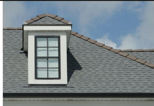
Lap Ridge Tiles

Hecker Ridge Tiles offers replacement ridge tiles that meet the Fortified Roof standards!