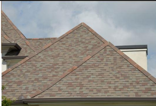
V Ridge Tiles