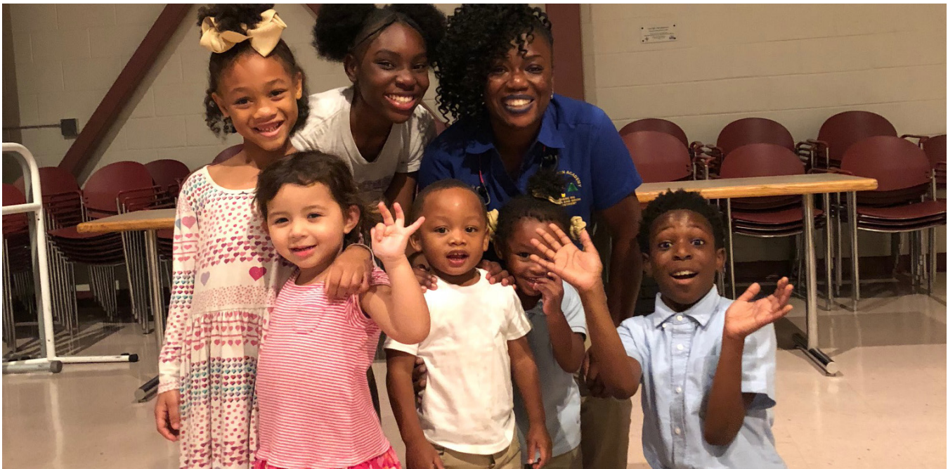
Children of the Climate and Equity Community Forum participants at the NORD Cut-off in the Algiers neighborhood.

Whether you are a young person, an elder, a person looking for a better job or business opportunity, an educator, a city official, a business leader, or a leader of a neighborhood association, faith-based organization or civic group, this report is for you. There is something each of us can do that contributes to our city becoming more equitable and better prepared for climate change. We hope that you will read this report and consider action in New Orleans.