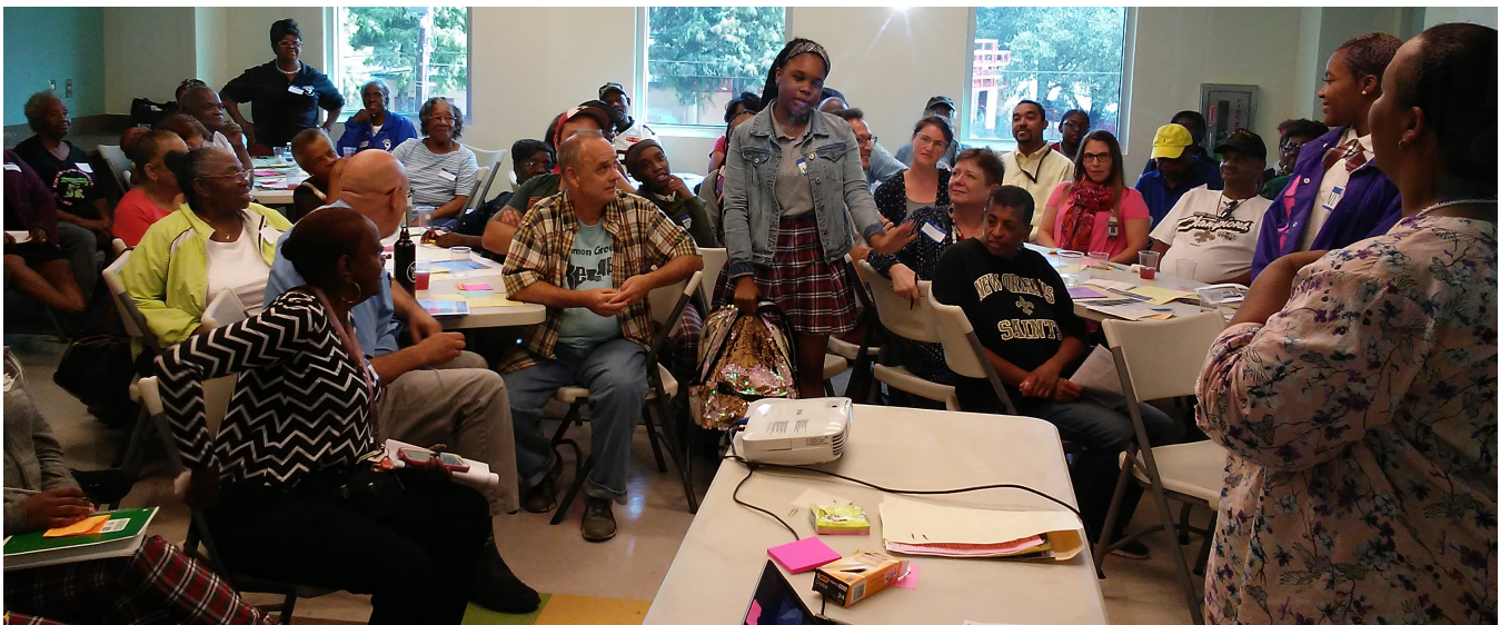
Community members at the Climate & Equity Community Forum in the Lower Ninth Ward neighborhood.

The recommended action steps are organized in four sections that identify the equity goals. Each recommended step is detailed to provide the “what,” “how,” and “potential key partners” for achieving equity through climate action in New Orleans.