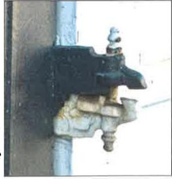
Clark's Tip hinge, typical